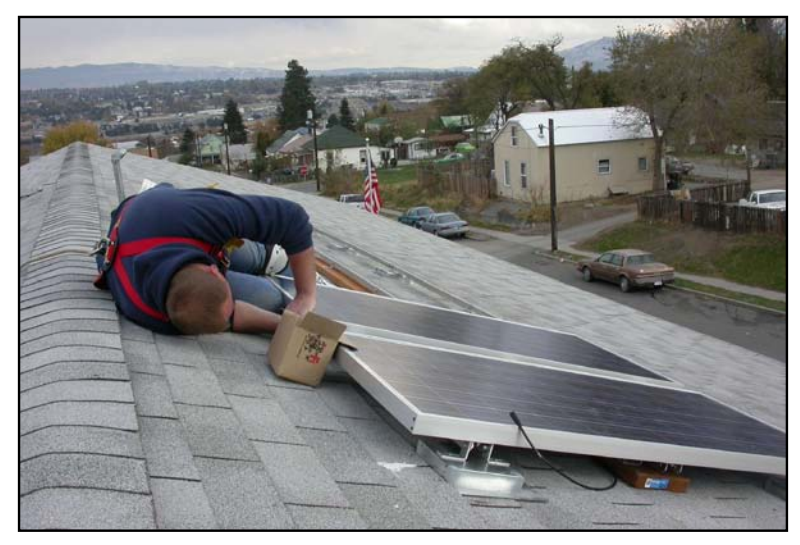
Eight panels went up on the Chelan-Douglas Community Action Center, 620 Lewis St., in October 2003.

Recognition Award from the Interstate Renewable Energy Council. The award recognizes innovative renewable energy projects and programs.